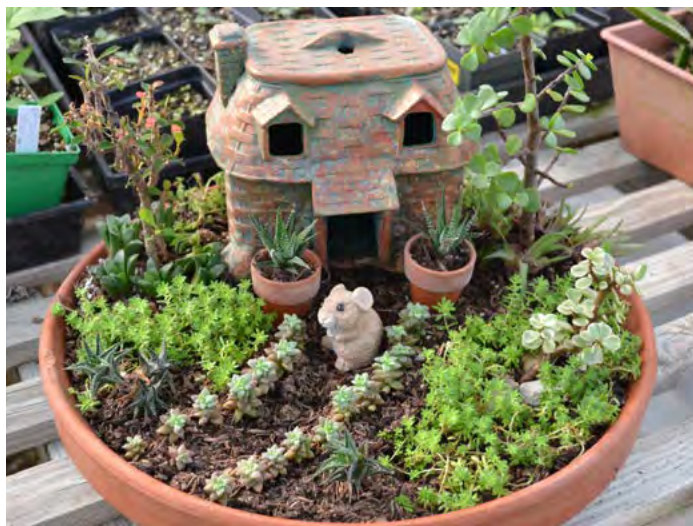
This "Mouse House", filled with a variety of succulents, is just one of many dish gardens East Baton Rouge Master Gardeners have been making to sell at their Annual Spring Garden Sale Saturday, April 9 at the LSU AgCenter Botanic Gardens at Burden.