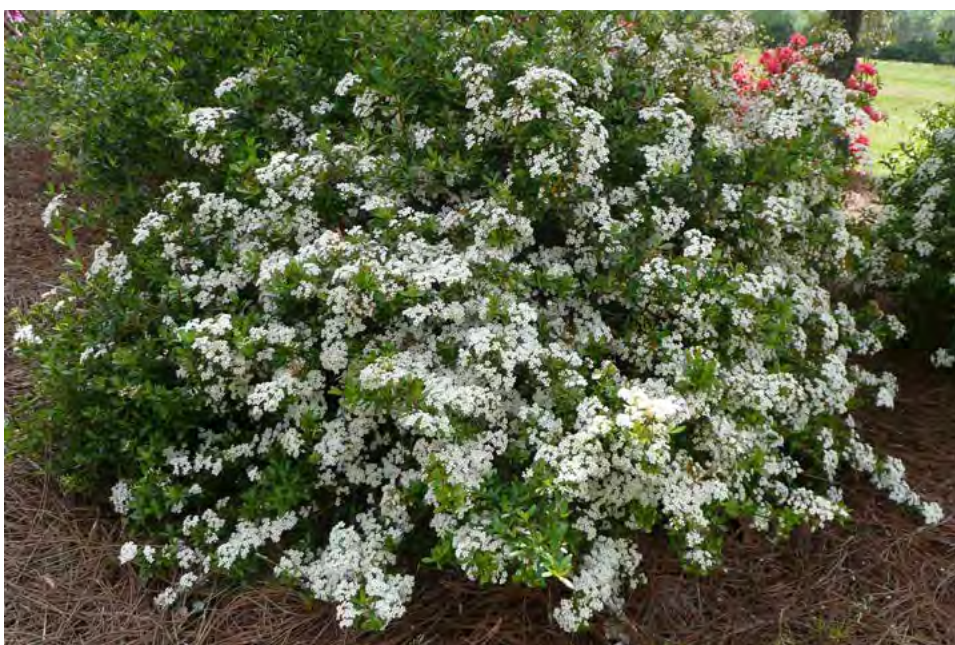
Mrs. Schiller's Delight viburnum