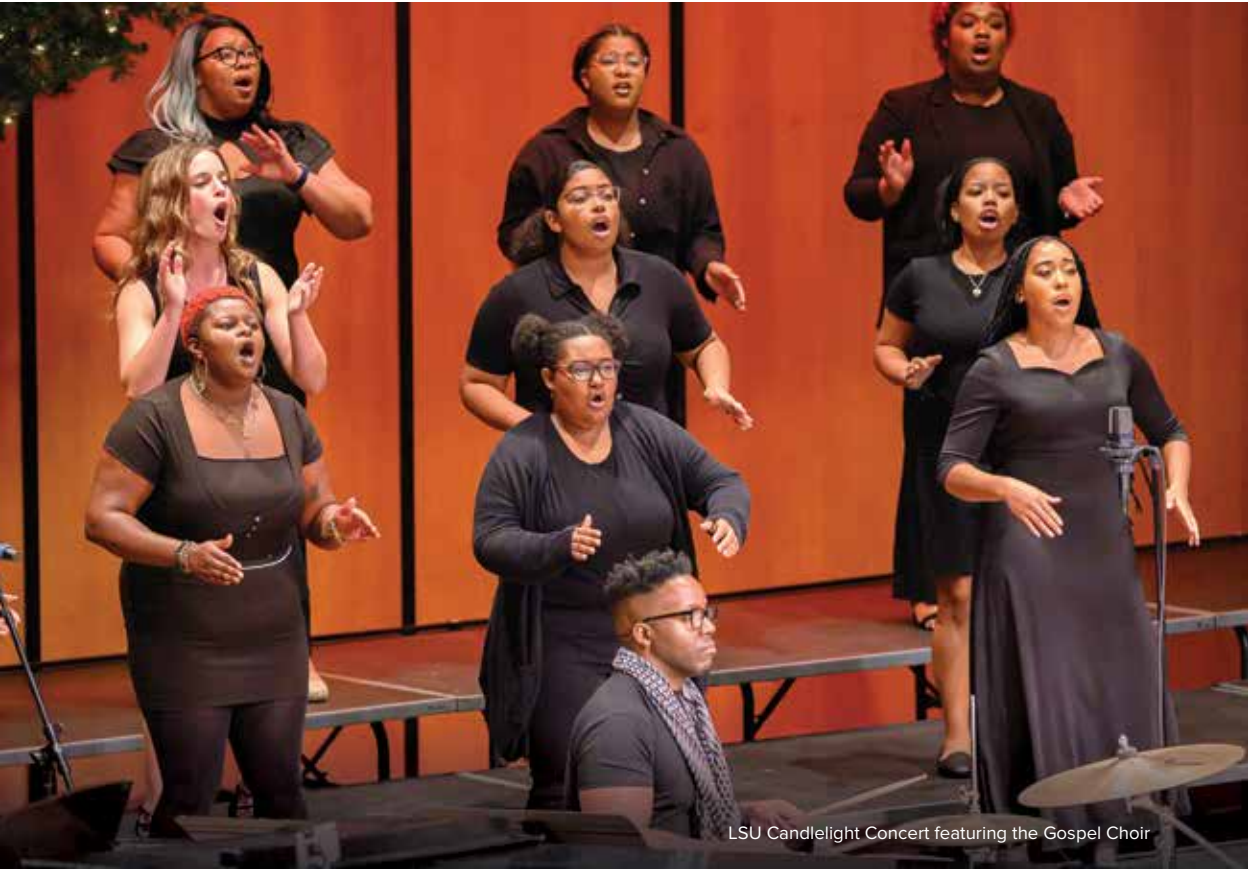
LSU Candlelight Concert featuring the Gospel Choir

The LSU Choral Studies area offers a variety of choral ensembles for students, each with an individual character and mission. Chorus members represent a cross-section of the LSU student population, including undergraduate and graduate students, who perform literature ranging from dramatic cantatas to gospel spirituals and folksongs.