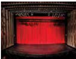
Shaver Theatre In the MDA Building, Dalrymple Drive & Infirmary Road