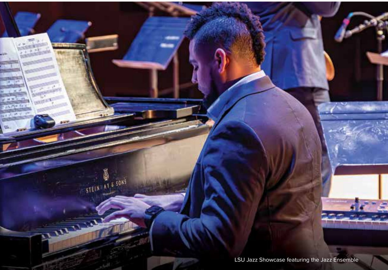
LSU Jazz Showcase featuring the Jazz Ensemble

LSU's Jazz Studies area boasts a rich history that can be traced back to the 1950s. Legendary jazz alumni, such as trombonist Carl Fontana and composer/pianist Les Hooper, have made significant contributions to America's great art form. The current generation of alumni includes saxophonist Brad Walker, active touring artist and top call player in New Orleans, and pianist Oscar Rossignoli, widely recognized as a rising star in New Orleans and beyond.