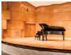
School of Music Recital Hall In the SOM Building, Dalrymple Drive & Infirmary Road