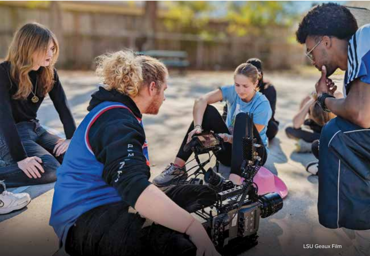
LSU Geaux Film

Offering comprehensive training from the undergraduate to graduate level, the School of Theatre is home to a community of artists, educators, and scholars, dedicated to the creation, cultivation, and understanding of the dramatic narrative arts. From passionate actors, dancers, and filmmakers to innovative designers, directors and technicians we feature the work of our students through a diverse array of productions annually, ranging from classic to contemporary work.