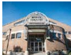
Reilly Theatre Tower Drive between Stadium Drive & Infirmary Road