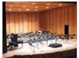
LSU Union Theater Veterans Drive & Highland Road