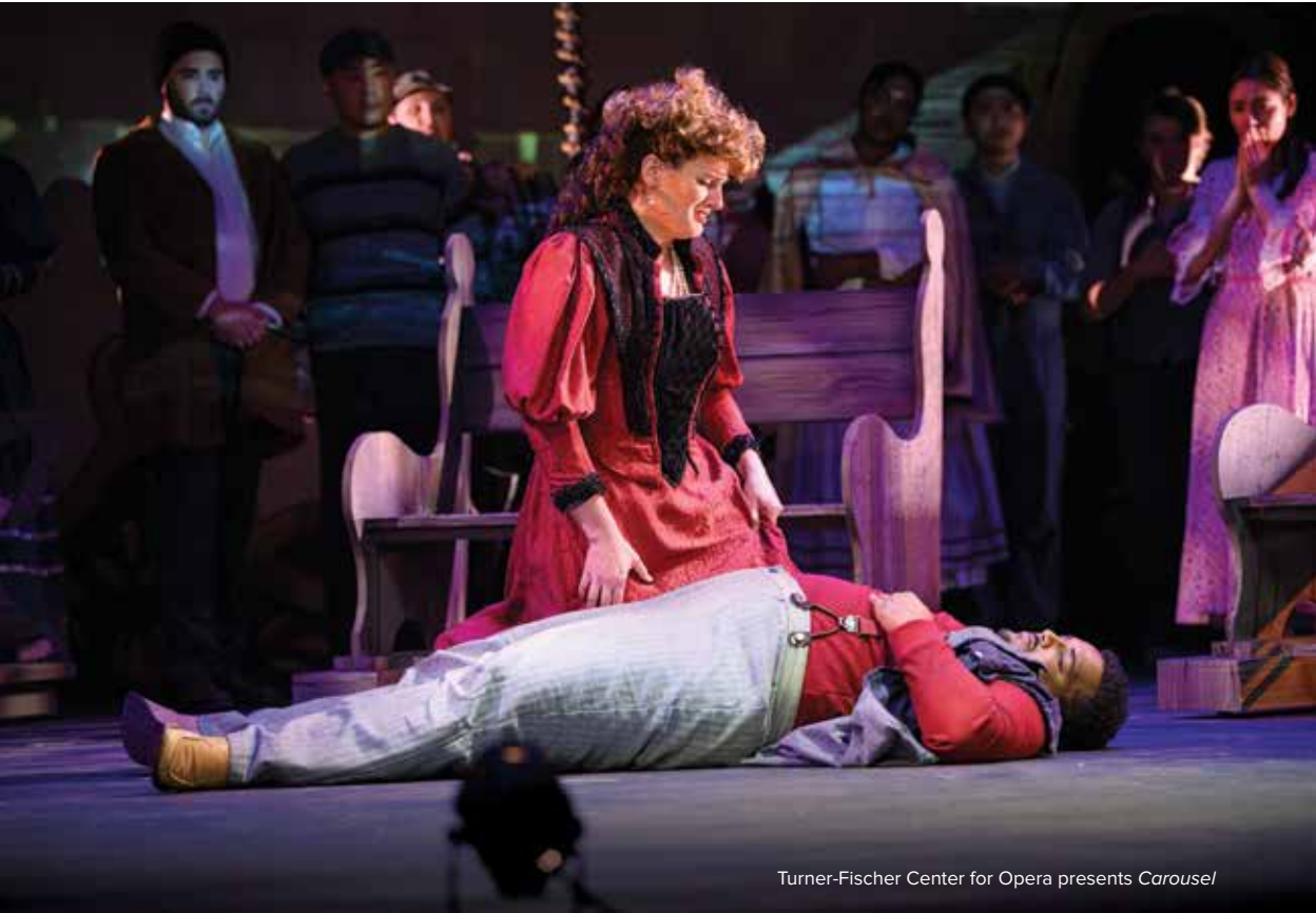
Turner-Fischer Center for Opera presents Carousel

The Turner-Fischer Center for Opera at LSU offers a comprehensive training program for aspiring opera students, who work with dynamic and accomplished faculty. The Center produces multiple full-scale productions each year, collaborating with the LSU Orchestral Studies area and LSU School of Theatre. Alumni can be seen performing on the world's greatest opera stages, including the Metropolitan Opera, La Scala, Covent Garden, Houston Grand Opera, San Francisco Opera, and more.