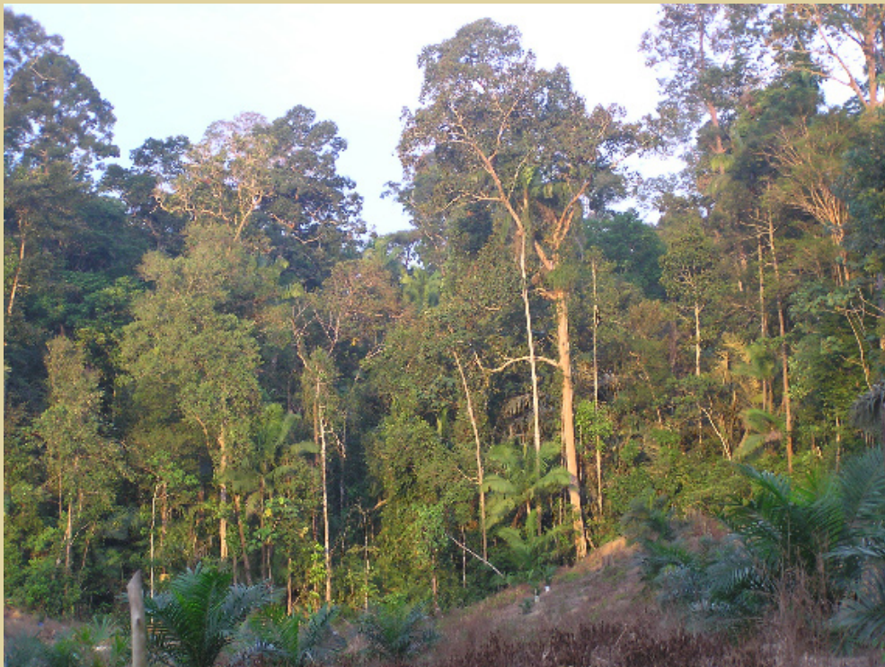
Rainforest with encroaching palms in the foreground

Another part of Malaysia in which I have spent a good deal of time is Lake Ke-