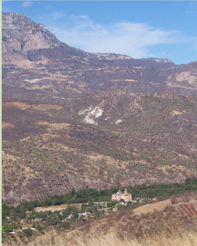
The town of Bolaños, Jalisco, nestled in the Sierra Madres.