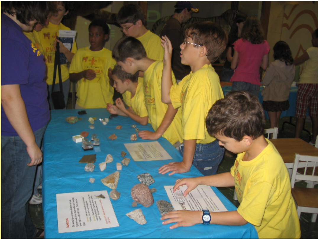
Kids ask questions about the rocks and minerals they received at the Louisiana Rock Record Special Saturday.