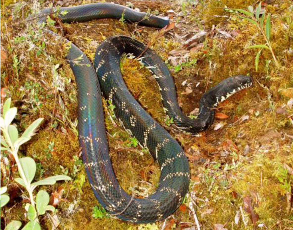
Left: Boelen's python Morelia boeleni from the highlands of New Guinea.