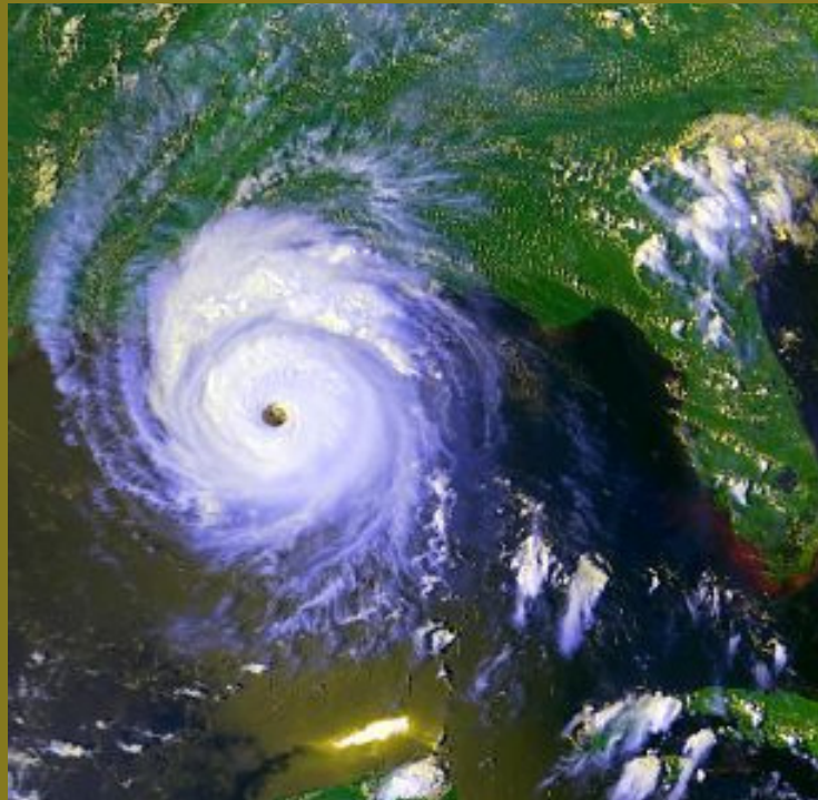
A picture of Hurricane Andrew from the Science Friday video on Hurricanes, Climate, and Weather. (Pick of the Week 1/25/07)