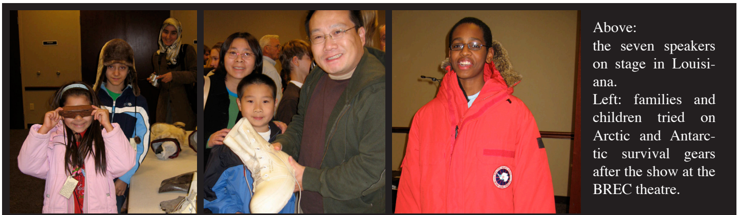
Above: the seven speakers on stage in Louisiana. Left: families and children tried on Arctic and Antarctic survival gears after the show at the BREC theatre.

“Furthermore, we didn’t really understand