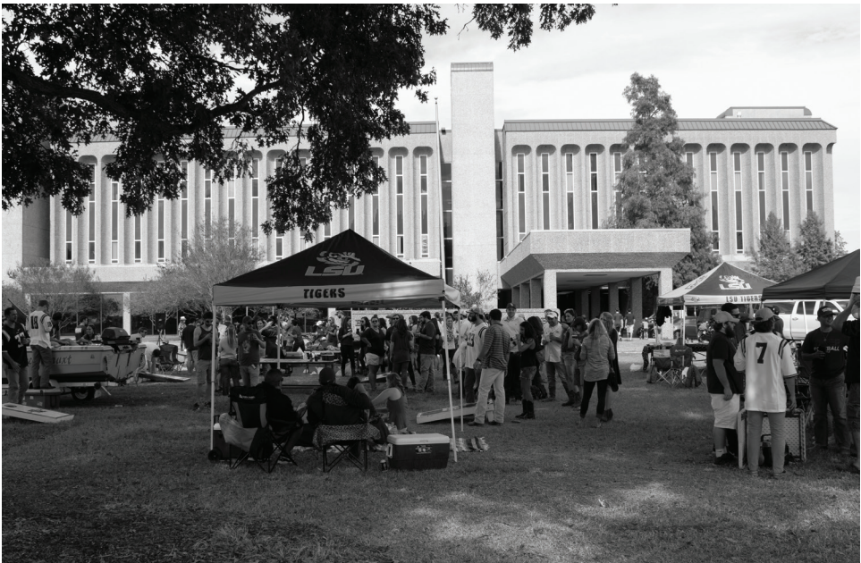
Fall in south Louisiana means LSU Tiger football and tailgating.

The Department of University Recreation provides a variety of recreational activities. To meet the diverse needs and interests of the University community, a multifaceted recreational program is offered that includes aquatics, informal recreation, healthy lifestyle programs, intramural sports, adventure recreation, sport clubs, and special event activities. For additional information, contact the Department of University Recreation.