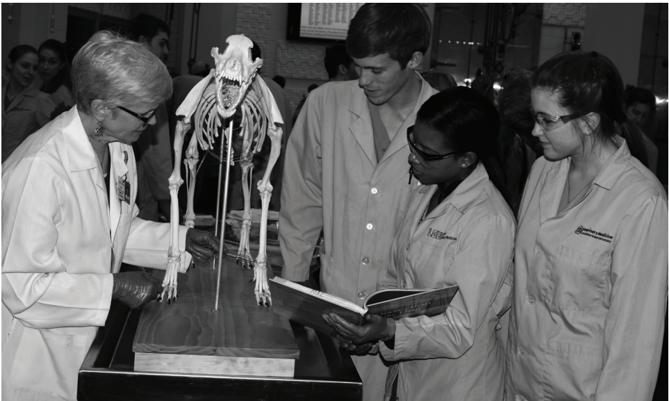
We Teach: First-year students spend up to 10 hours a week in anatomy lab.

5151 Clinical Skills 2 (1) 35 contact hours. The Clinical Skills 2 Spring course is a mastery course that uses instructional videos, models, mannequins, simulators, and other teaching methods to enable first year veterinary medicine students to learn and practice technical and non-technical skills related to correct handling and physical exam of different species, and familiarity with common veterinary equipment and procedures. This course