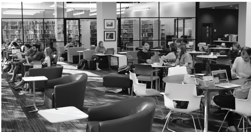
We Teach: The LSU Veterinary Medicine Library is accessible 24/7.

All fees are estimates and the LSU Board of Supervisors may modify tuition and/or fees at any time without advance notice. Check current tuition and fees at www.lsu.edu/bgtplan/Tuition-Fees/fee-schedules.php .