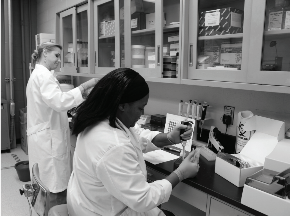
We Discover: The LSU School of Veterinary Medicine investigates a variety of diseases.

The safest and most effective method of preventing rabies in high risk groups is by pre-exposure vaccination. Because the risk of exposure is especially high for students of veterinary medicine, it is the policy of the School of Veterinary Medicine that all students must receive pre-exposure rabies vaccine before or during the fall semester of their first year in the professional curriculum. The vaccine will be available through the LSU Student Health Center for enrolled veterinary medicine students.